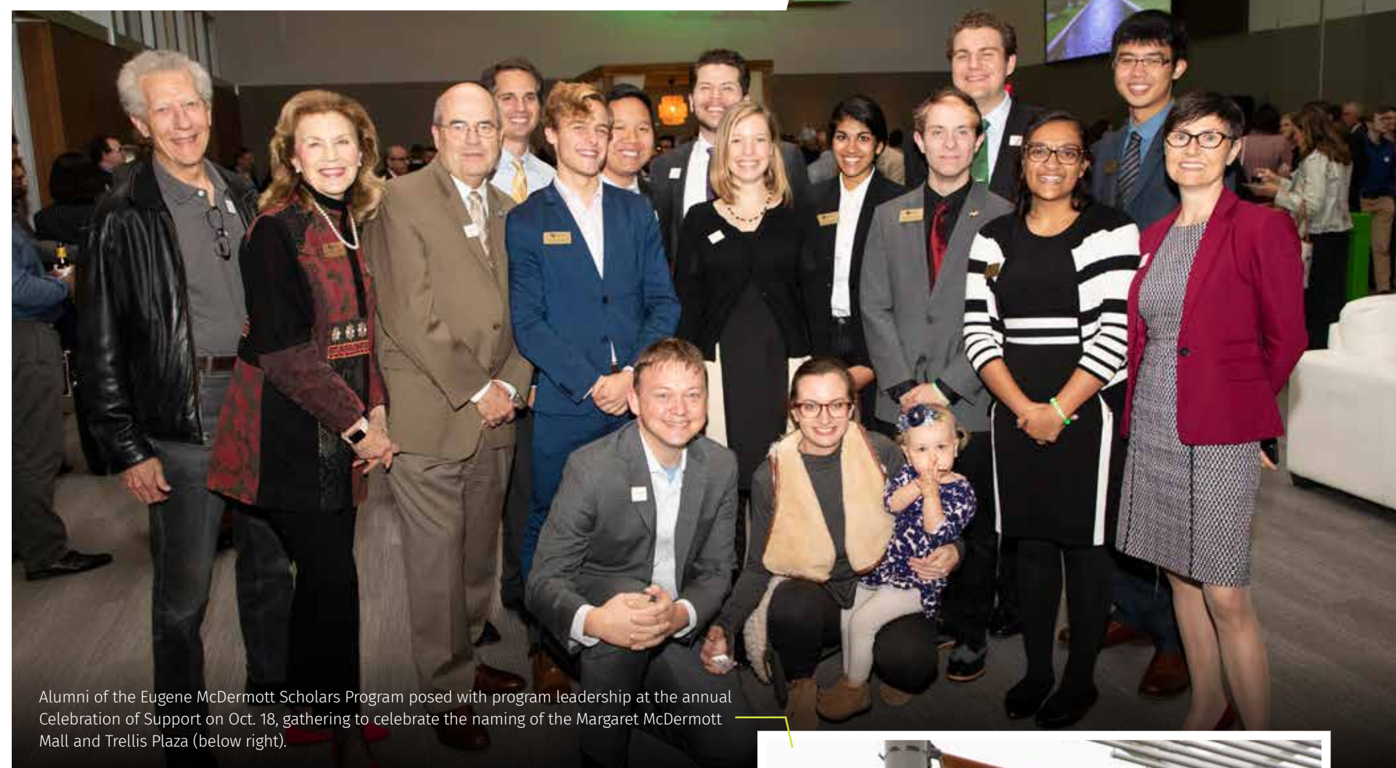
Alumni of the Eugene McDermott Scholars Program posed with program leadership at the annual Celebration of Support on Oct. 18, gathering to celebrate the naming of the Margaret McDermott Mall and Trellis Plaza (below right).