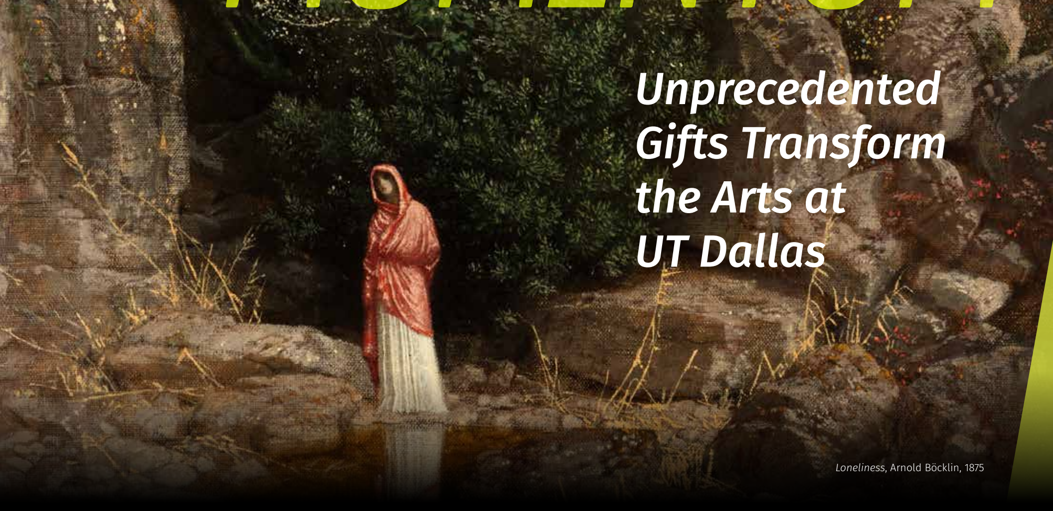
Loneliness, Arnold Böcklin, 1875