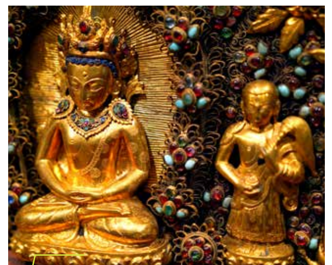
Top left: Head of a Buddha China, Northern Qi dynasty, 6th century Top right: Vase, Qing dynasty, 18th century Above: Plaque of a crowned Buddha, 19th century